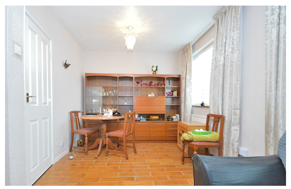
14 Canons Walk, Northampton NN2 8HR £240,000 - Freehold