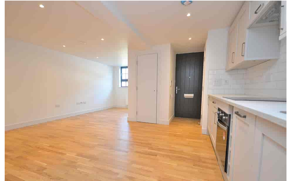
9 Plot 1, The Barker Building, Countess Road, Northampton NN5 7FA £140,000 - Leasehold