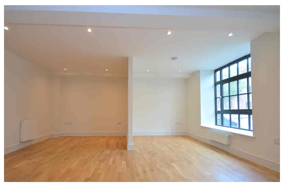
Plot 15 The Barker Buildings, The Barker Buildings, Northampton NN5 7FA £140,000 - Leasehold